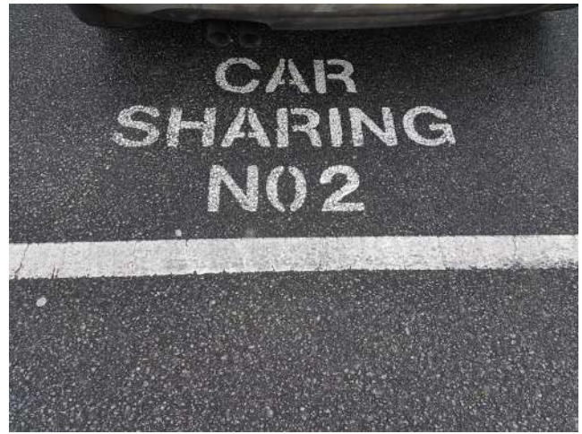
'The Northern Commute' designated priority car parking space for carpoolers