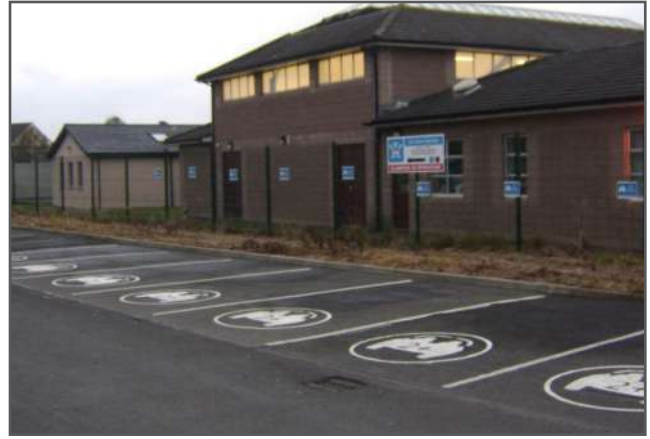
Designated carpooling spaces, clearly identified with signage and stencil markings. High visibility of the spaces also promotes and highlights the scheme to non carpoolers

The growth in the numbers carpooling to and from campus can be attributed to several factors. A 'Sustainable Travel' coordinator was appointed, ensuring that the scheme was implemented across campus. Support from the Student's Union, Green Campus Committee and Admissions Office also ensured that a wider network of staff and students were made aware of the scheme through various targeted initiatives. Ongoing promotion through orientation week and poster campaigns ensured that incoming students were made aware of the scheme, leading to increasing participation rates. Finally, clearly marked carpool designated spaces, and enforcement of carpool parking policies increased the credibility of the scheme.